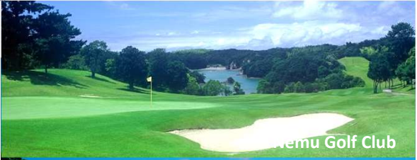
Nemu Golf Club