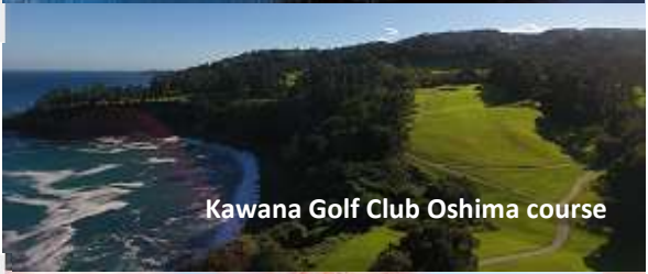
Kawana Golf Club Oshima course