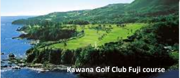
Kawana Golf Club Fuji course