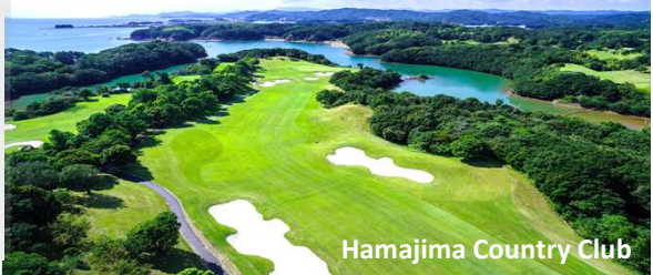
Hamajima Country Club