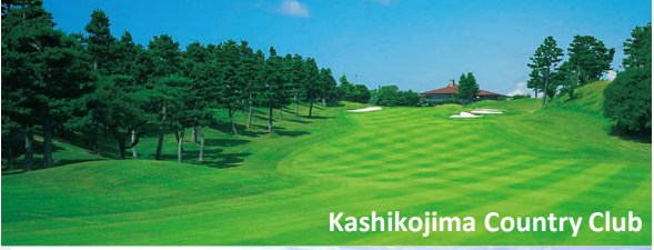
Kashikojima Country Club